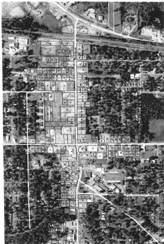
Exhibit B. MAP OF PETAL CENTRAL BUSINESS DISTRICT NORTH